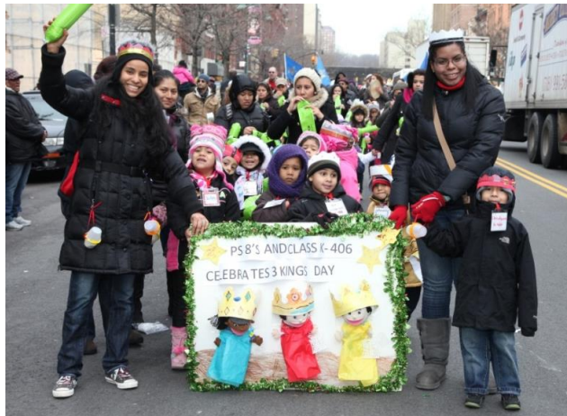
Three Kings Day Parade 2012 - Collection of El Museo del Barrio

Enjoy your crown as you become one of El Museo's honorary Kings or Queens! Don't forget to bring your crown and/or instruments with you to El Museo's virtual Three Kings Day celebration on January 6!