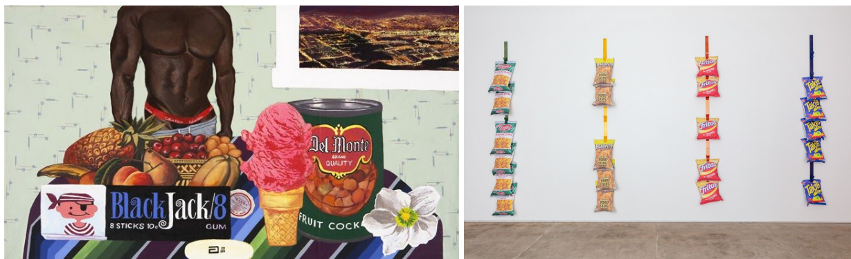
Joey Terrill, Black Jack 8 , 2008 | Lucia Hierro, Racks , 2019