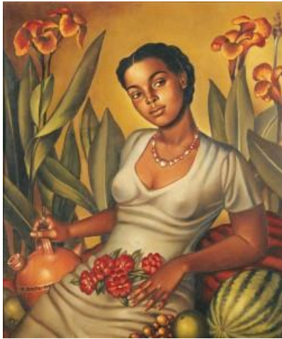
Figure 1 Enrique Grau Araújo (Panamá 1920 - Bogotá 2004) La mulata cartagenera , 1940, Oil on canvas 71 x 60,8 cm, Collection of the Museo Nacional de Colombia

October 11 - 13, 2012 at El Museo del Barrio and The Studio Museum in Harlem